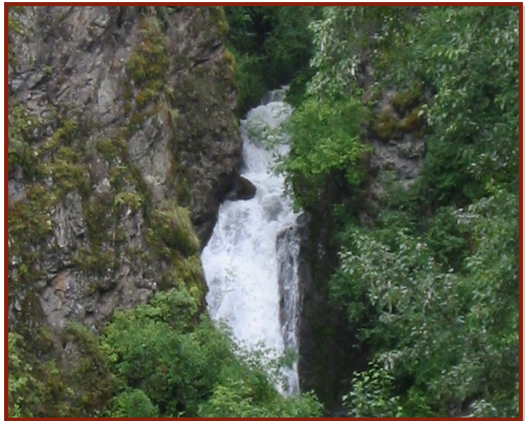
Thunder Bird Falls Trail Profile

Access: Thunder Bird Falls Trailhead Allowable Uses: Hiking. No bikes allowed. Distance: 1 mile one way Elevation Gain: 175 feet Difficulty: Easy